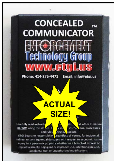
Concealed Communicator™ Base Unit

Dimensions (l x w x h): ~ 2.00 X 0.60 X 2.88"