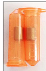
Large Earpiece Magnet Set