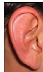
Field Operator with Earpiece Magnets Inserted

→.....→ Audio Signal Picked Up by Low-Profile Microphone