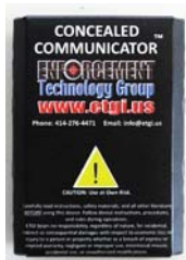
Concealed Communicator™ Base Unit