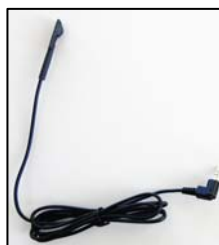
Tone Generator Button