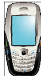
"Coach" Cell or Landline Phone