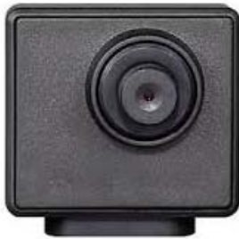
Dimensions: 1.18" X 1.18" X 0.78"