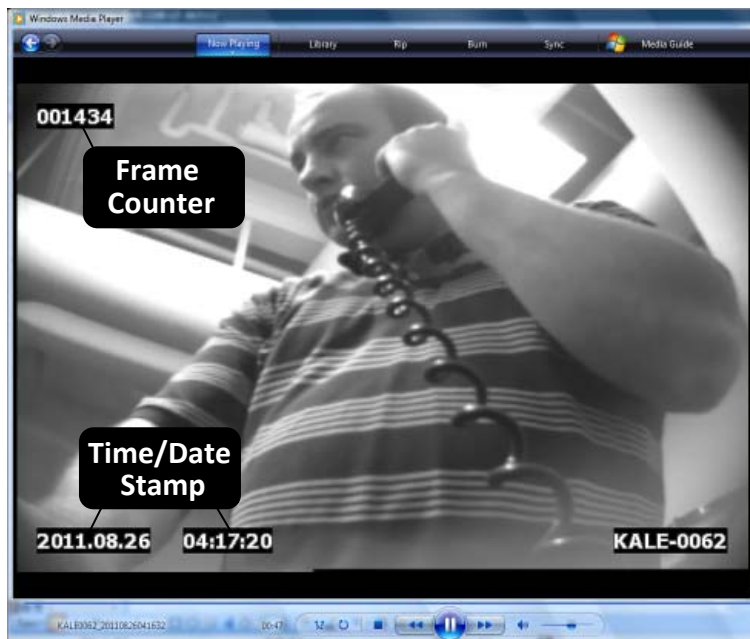
Portable Digital Video Recorder Video Recording Playback Screen Shot

**Video Recording Time: Assumes no data is stored on device's hard drive prior to video recording session. Recording hours are listed at highest bit rate (5 Mbps). Greater recording times can be achieved by decreasing bit rate/image quality or through use of an SD memory card (not included). Device's expandable memory slot supports SD cards with up to 16 GB memory capacity.