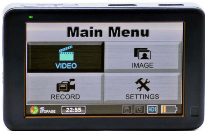
Full HD Portable DVR (front view) Dimensions: 5.60 X 3.65 X 1.20"