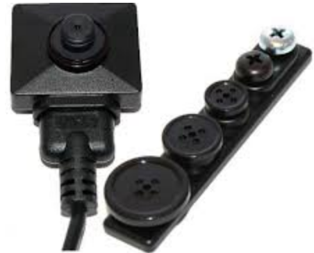
WDR Camera with Button/Screw Camera Head Adapters