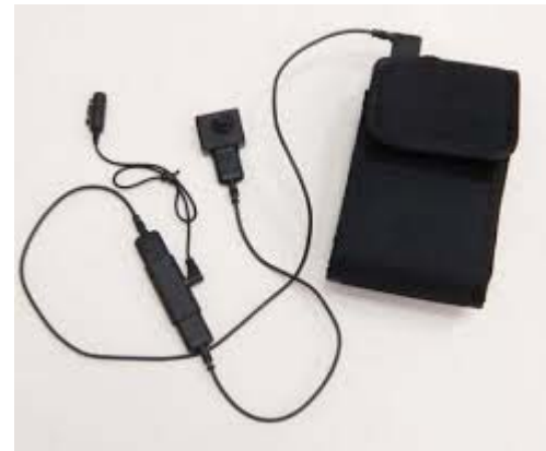
WDR Camera & Microphone Connected to ETG-DVR-TOUCH