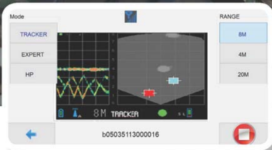
XaverNet™ User Interface

The XaverNet™ is a remote wireless device that works in combination with Xaver™ 100 Handheld, Through-Wall Life Detector and Xaver™ 400 Compact, Tactical Through-Wall Imaging Systems . It enables the user to remotely receive real time visual data and fully control up to four Xaver™ 100 or 400 Systems simultaneously.