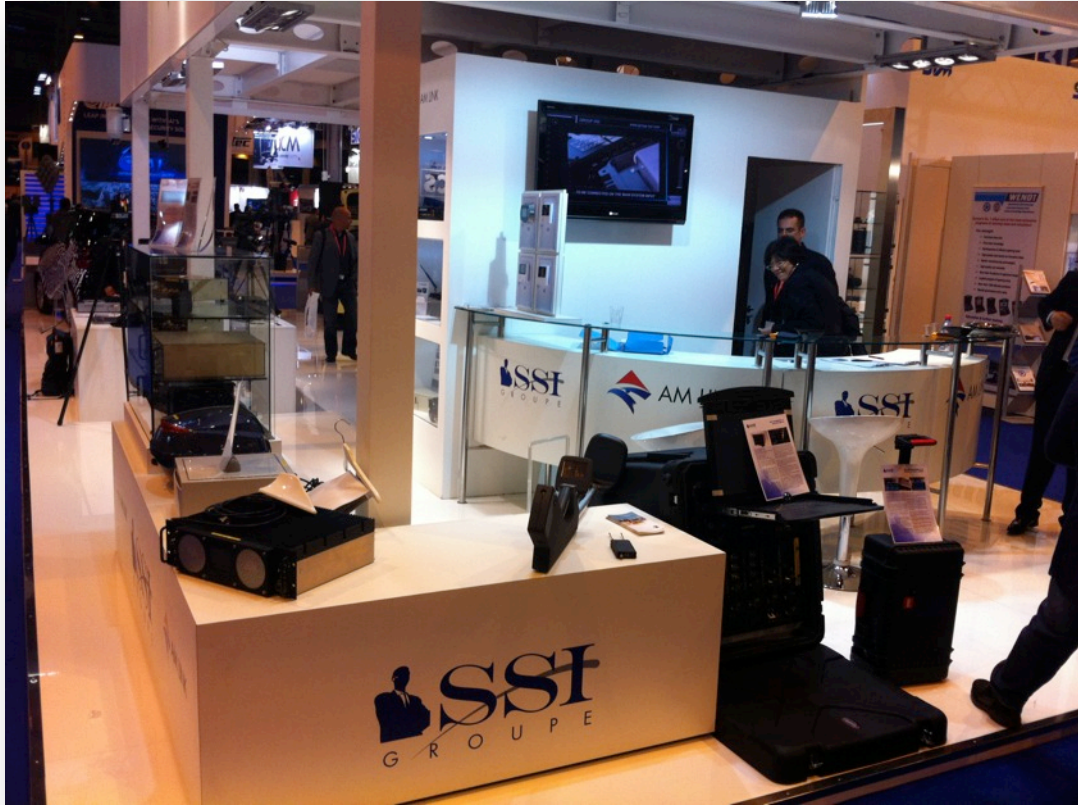
COUNTER TERRORISM / IMSI CATCHER AND LOCATING