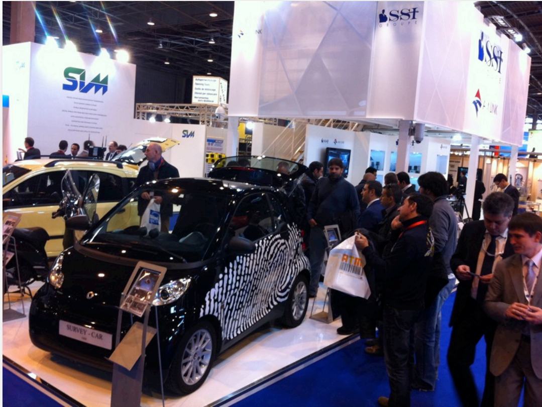
SURVEILLANCE or AUDIO-VIDEO INTERCEPTION VEHICLES