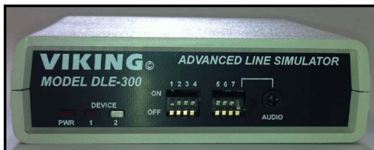
Line Capture Module (front view)