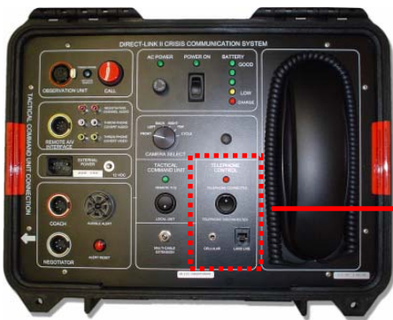
Direct-Link 007 Series System's Command Unit Console