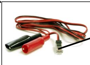
RJ11 Male to Alligator Clip Adapter