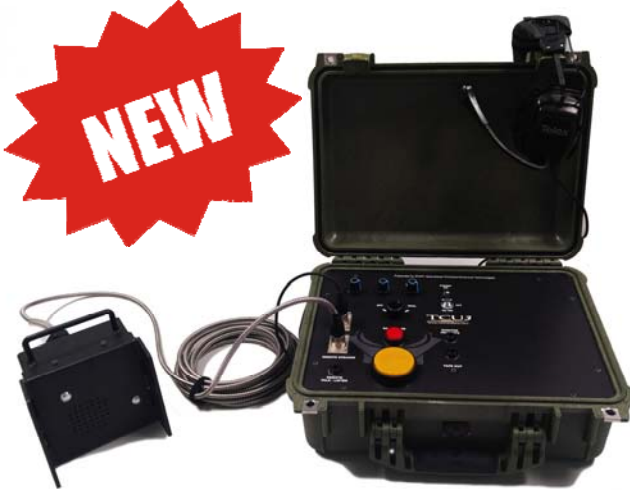
TCU-3 Command Module, Remote Speaker/ Microphone & Headset

An Affordable, Versatile, Compact & Easy-to-Use Tool Developed for a Variety of Critical Incident Response Applications