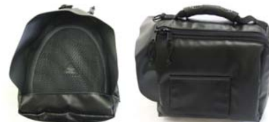
Loudspeaker Custom/Padded Deployment Case (front and side views)