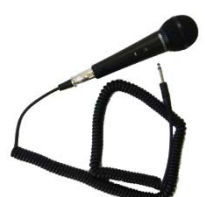
Handheld Mic (Item# ETG-WFR-HHM)