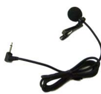
Lapel Mic (Item# ETG-WFR-LM)