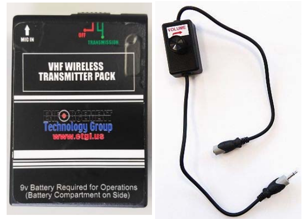
VHF Transmitter Pack with Remote Volume Control Dial (Item# ETG-WFR-TX)