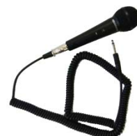
Handheld Mic (Item# ETG-WFR-HHM)