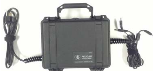
Wireless First Responder (WFR) Range Hailer Configuration Custom Tri-bank AC Power Adapter/Charger - Capable of powering/charging (3) Loudspeaker Units simultaneously