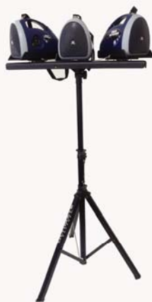
Wireless First Responder (WFR) Range Hailer Configuration Custom Tripod - Capable of mounting (3) Loudspeaker Units simultaneously