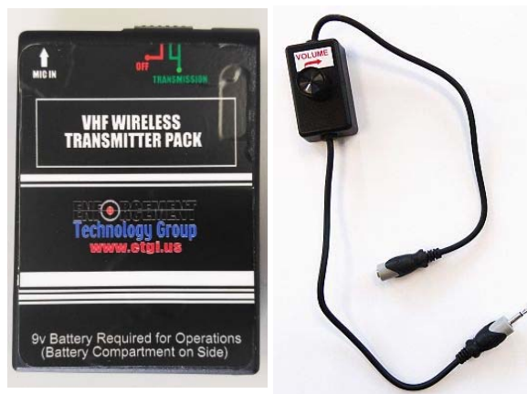
VHF Transmitter Pack with Remote Volume Control Dial (Item# ETG-WFR-TX)