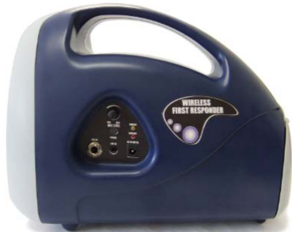
Wireless First Responder (WFR) Loudspeaker Unit with Integrated/Internal VHF Wireless Receiver (Item# ETG-WFR-LS)