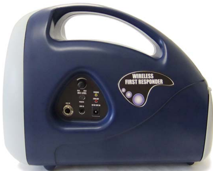
Wireless First Responder (WFR) Loudspeaker Unit with Integrated/Internal VHF Wireless Receiver (Item# ETG-WFR-LS)

Helps to protect the WFR Loudspeaker Unit when being operated outside in inclement weather conditions.