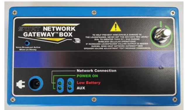
SWAT Network Gateway™ Box