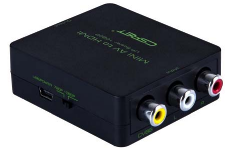
Analog to Digital HDMI Converter Box (RCA/Composite Input)